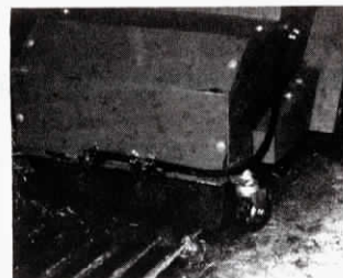
Ordinary tap water, piped to the machine via a garden hose, works in conjunction with the brush to sweep the grates clean.

"It only uses a few gallons of water per cleaning," explains Isne. "There's a restricted orifice in the hose connection which cuts the flow rate way down. Water is piped in three directions on the underside — one fine-mist stream is directed in front of the brush to pre-soak manure a second or two before it's swept