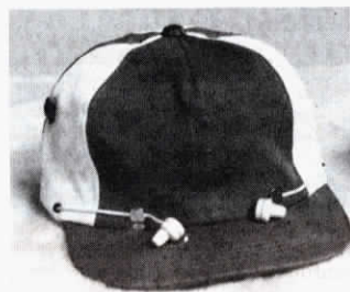
Buttons on the side turn the radio on or off and adjust volume.

The cap is available in green and white, red and white, navy blue and