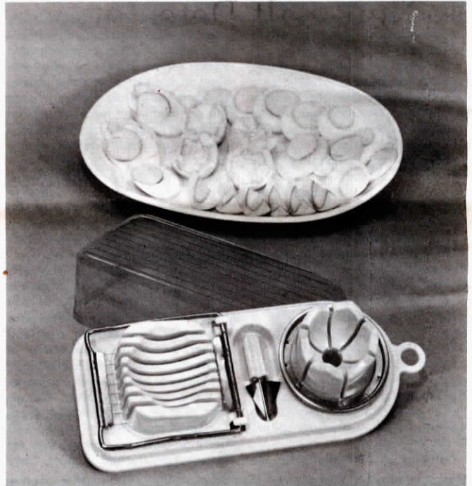
New kitchen machine slices eggs three ways.