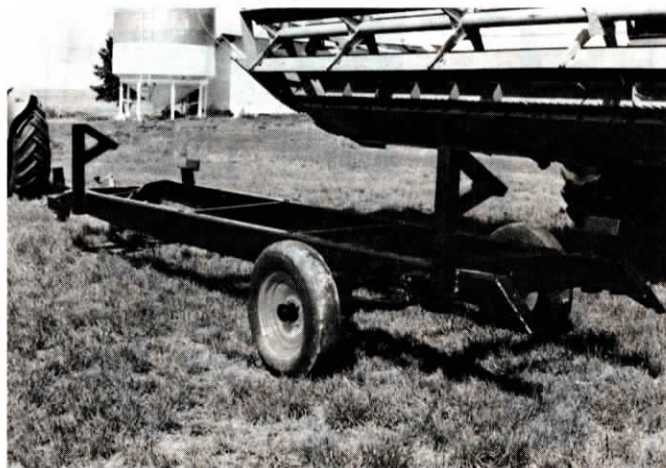
Header supports raise and lower by means of telescoping tubing.