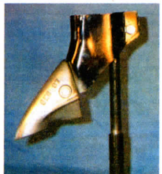
Points can also be pinned on, such as this Eagle Beak point on a Case-IH hoe drill.