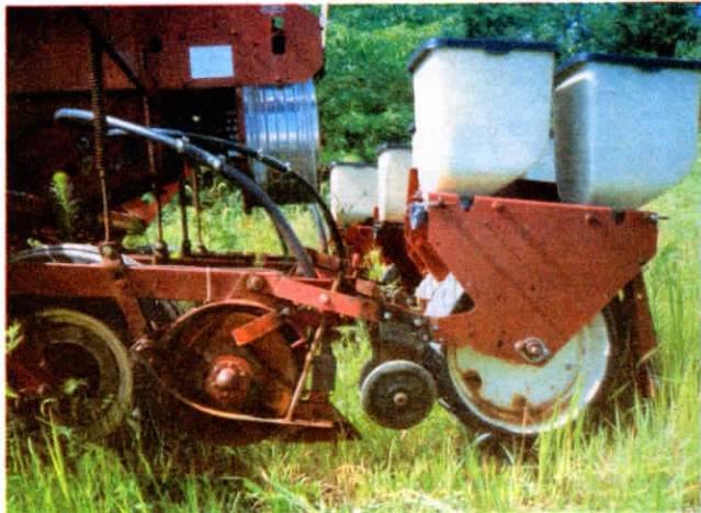
Andries bolted 2-in. wide metal strips along either side of disc openers to keep dirt from being thrown out of seed furrow. A pair of snowmobile boggie wheels mounted behind disc openers are used to close the furrow.