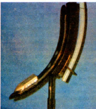
Chisel point with weld-on point installed and fertilizer tube holder.

Contact: FARM SHOW Followup, M&J Cotton Farms, Inc., P.O. Box 552, Oak Grove, La. 71263 (ph 318 428-4842).