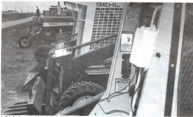
A 24-ft. long cable plugs into plastic control box (see arrow) mounted on the vehicle.