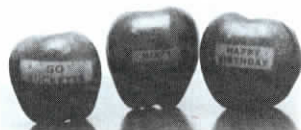
Pre-printed adhesive tape, solid black with transparent letters, is applied to apples just before they start to ripen.

Workers pull the tape off when apples are picked. Bergman says the tape is removed easily and, if any sticky residue remains, they simply wipe it off. He uses Red Delicious apples because they "bleach out" best.