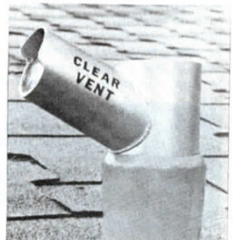
Built-in magnifying lens focuses sunlight onto vent to keep ice from plugging it.

Sells for $49.50, plus $2.50 for shipping. For more information, contact: FARM SHOW Followup, Behrens Construction and Manufacturing, Rt. 6, Box 227, Minot, N. Dak. 58701. (ph 701 839-5643).