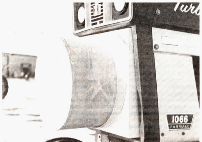
New radiator dust protector virtually eliminates overheating, says manufacturer.

For more information, contact: FARM SHOW Followup, Jones Industries, P.O. Box 4262, Waco, Tx. (Ph. 817 799-5563).