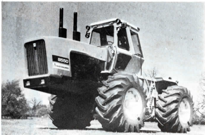
A 300 hp engine powers the new 8550, biggest in the Allis Chalmers line.