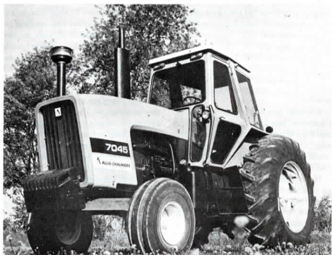
New 145 PTO hp 7045 is available with new Acousta cab II and 20 speed Power Director transmission with 2-speed shift-on-the-go capability. It's powered by a 145 hp diesel. The new 7020 has a 120 hp engine.

For more details on these new A-C tractors, see your local dealer or contact: FARM SHOW Followup, Allis Chalmers Corp., Box 512, Milwaukee, Wis. 53201 (ph. 414-475-4270).