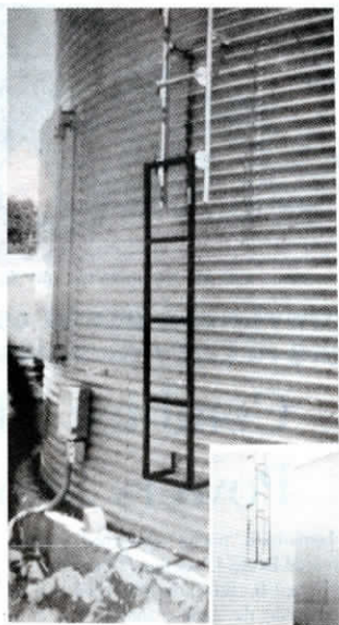
You simply hang the ladder from a higher step when not in use.

For more information, contact: FARM SHOW Followup, Reed's Bin & Building Center, Inc., 120 Northwest 8th Ave., Galva, Ill. 61434 (ph 309 932-2655).