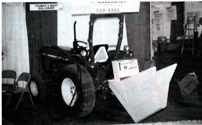
"Sneaky Pete" slices through soil with almost no disturbance to surface.