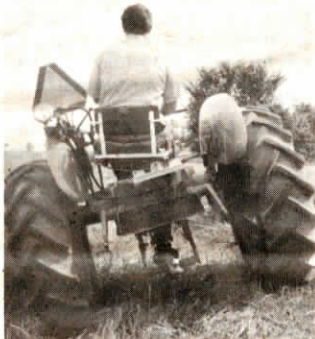
Operator remains comfortably upright even when tractor's at an angle.

"Because the rider doesn't have to keep leaning and straining, he's more in control and can do a better job. The seat swings smoothly back and forth with no quick rocking motions," explains Radford, who says he got the idea for the seat when he was in the Air Force from the realization that jets compensated for centrifugal force when they bank during turns. He built the first prototype in a car. The swinging seat lets the operator maintain a comfortable posture even