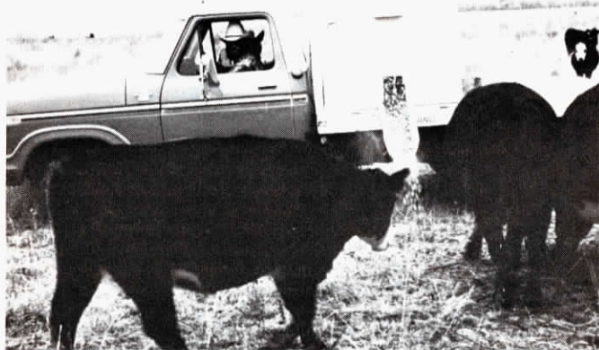
Driver operates dash-mounted switch to control amount of feed dispensed "on the go".

For more details, contact: FARM SHOW Followup, Summers Mfg., Maddock, N.D. 58348 (ph 701-438-2242).