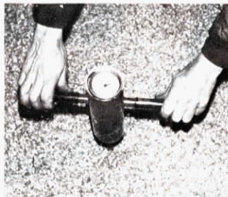
Long Tempprobe can be carried from bin to bin, or inserted into side of bin via an entry collar as shown below.

For more details, contact: FARM SHOW Followup, Don Demorest & Sons, 3897 Waldo-Fulton Road, Waldo, Ohio 43356 (ph. 614-726-2554).