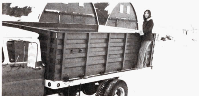
Spring-loaded catwalk (7 in. wide) flips up alongside box when not in use.

For more details, contact: FARM SHOW Followup, Farnam Equipment Co., Box 21447, Phoenix, Ariz. 85036 (ph. 602-244-8261).