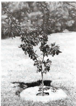
The Growth Ring holds 6 1/2 gal. of water which slowly seeps out to the tree. The ring also acts as a weed barrier.

The "Growth Ring" is available in two sizes. The 6 1/2-gal. model, useful for trees and shrubs, is 2 ft. in outside dia., 6 to 8 in. high, and has a 6-in. dia. center hole. The