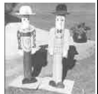
Fence post people made of post, flat boards, plywood.

Contact: FARM SHOW Followup, Remi Girard, Rt. 2, Pickardville, Alberta, Canada T0G 1W0.