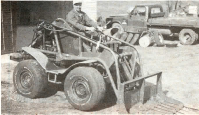
Two levers steer maneuverable home-built skid steer loader.