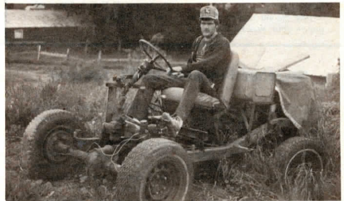
An IH Scout frame provides the chassis for this loader which is powered by a Dodge slant-six engine.

Contact: FARM SHOW Followup, Don Grenier, 3243 Oak Green Ave., Stillwater, Minn. 55082 (ph 612 439-2451).