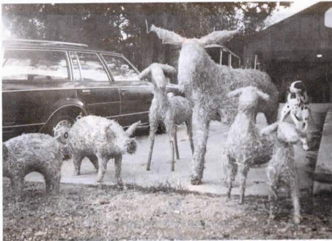
Johnson makes all types of straw animals including mules, pigs and sheep.