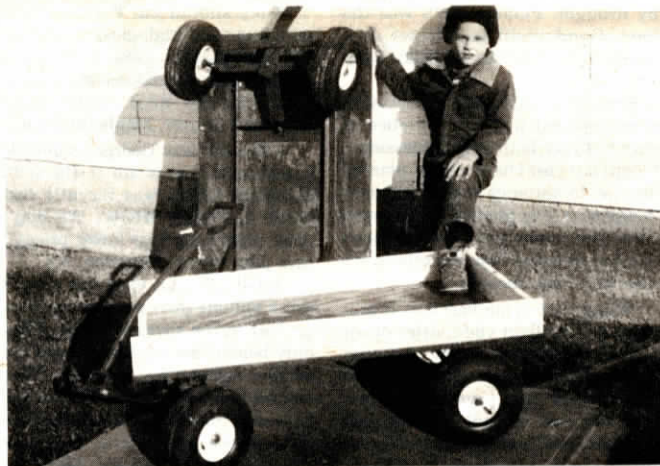
Wagon weighs 70-lbs. and is built heavy for work or play.

For more information, contact: FARM SHOW Followup, James L. Fish, 1557 C.R. 995, Rt. 4, Ashland, Ohio 44805 (ph 419 289-2013).