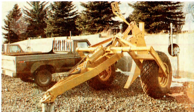
Home-built $500 rig lays field drainage tile, power cables, water lines and sewer lines.