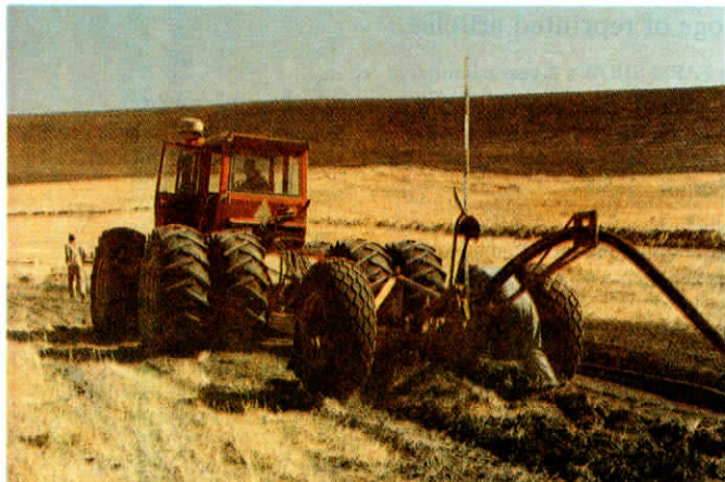
Perforated tile feeds internally through ripper tooth to maximum depth of 4 ft.

For more information, contact: FARM SHOW Followup, Fleener Enterprises, Rt. 1, Box 93, Pullman, Wash. 99163 (ph 509 872-2705).