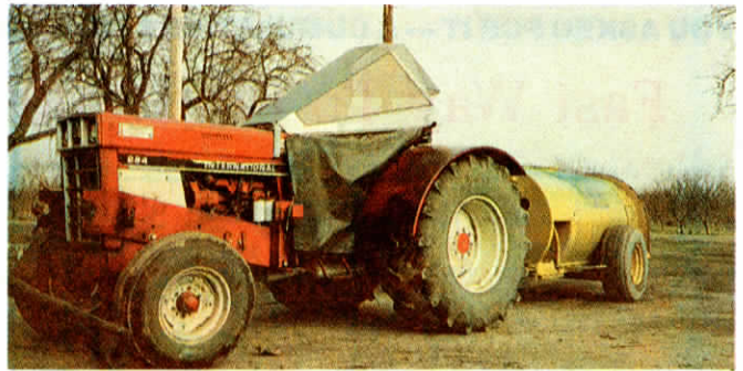
New cab is made of Lexan, a product commonly used for airplane cockpits.