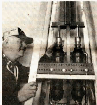
Twin 3-in. cylinders compress air on both the up and down stroke.

in this windmill since 1933 and we carry 100% of all parts back to 1933 as well as parts for many earlier models," he says, noting that a complete mail order catalog is available (send $1 for postage).