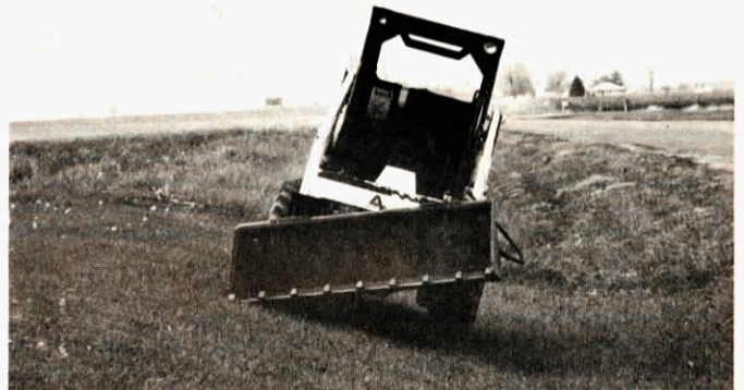
A 2 1/2-in. cylinder and mounting bracket mounts between bucket and loader arms.

SHOW Followup, David G. Adams, Battery Cable Pliers, Inc., Rt. 1, Box 150, New Madrid, Mo. 63869 (ph 314 471-2413 or 472-0220).