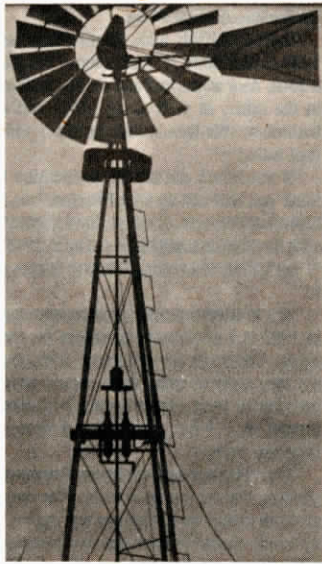
The compressor simply bolts to the tower and pump shaft. It fits any brand of windmill.

O'Brock is a dealer for Aermotor windmills. "There have been no major changes