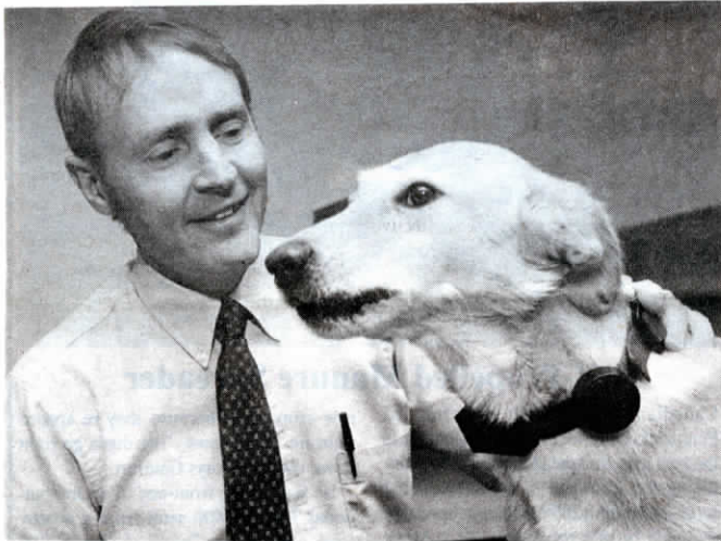
A microphone on inner side of collar "hears" dog barking and triggers an intense burst of high frequency sound after the barking stops.