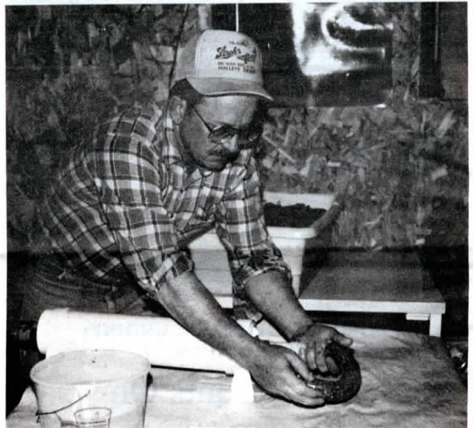
The 20-in. long cylinder handles 8 to 10 lbs. of meat at a time.

New Products Especially For Women And The Farm, Ranch Home.