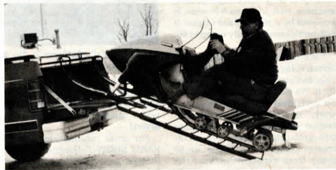
Ramp telescopes open in seconds and mounts on tailgate when not in use.

For more information, contact: FARM SHOW Followup, Power Equipment Corp., 134 Opus Center, 9900 Bren Rd. East, Minnetonka, MN 55343 (nh 612 933-8084).