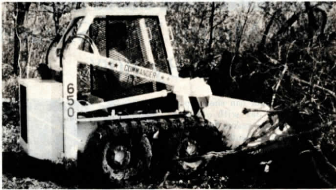
Do-it-yourself skid-steer loader kit saves thousands of dollars, says the manufacturer.