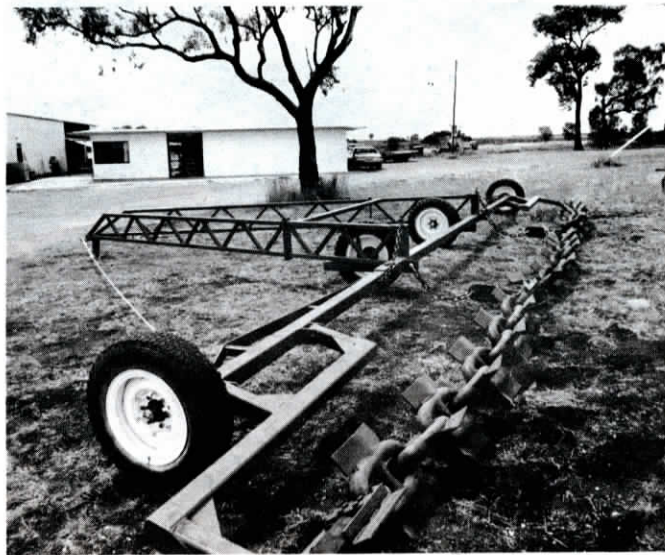
Paddles welded to huge 100-lb. chain links create "mini" rain dams.

For more information, contact: FARM SHOW Followup, Agri-Vator Mfg. Co., Rt. 1, Box 100, Caldwell, Texas 77836 (ph 409 535-7505).