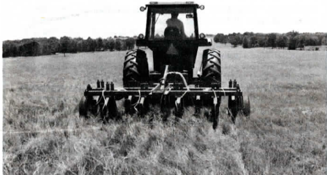
Agri-Vator is equipped with 15-in. long shanks that penetrate as deep as 8 in.

For more information, contact: FARM SHOW Followup, Big John Mfg. Co., Inc., Box 456, Osmond, Neb. 68765 (ph 402 748-3860 or 748-3868).