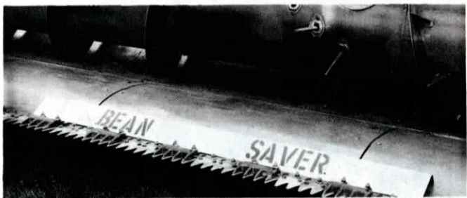
"Bean Saver" prevents shattered beans from rolling off platform.

For more information, contact: FARM SHOW Followup, Bruce Smallacombe, Capella Sales & Engineering, P.O. Box 92, Capella, Queensland, Australia, 4702 (ph 079 84 9211).