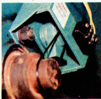
If shaft stops turning, belt-driven sensor switch closes, causing audible alarm in cab to go off.

"Installation of the sensor requires no modification of the machine. You simply remove one bearing flange nut on the shaft to be monitored, put the sensor assembly in place, wrapping the O-ring belt around the shaft to be monitored, and then retighten the flange nut. The warning assembly mounts in the cab. To wire the monitor, you run one wire from the sensor to the warning assem-