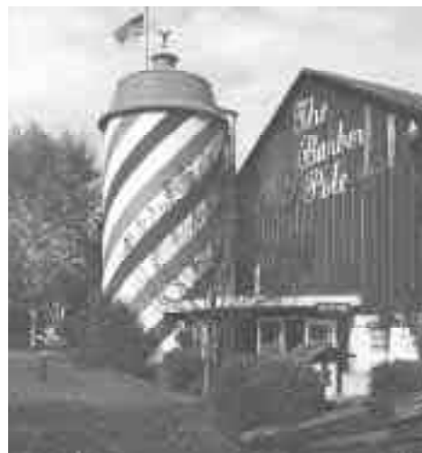
Gumienny's 13-ft. dia., 42-ft. tall cement silo barber pole is painted red, white and blue with latex paint.