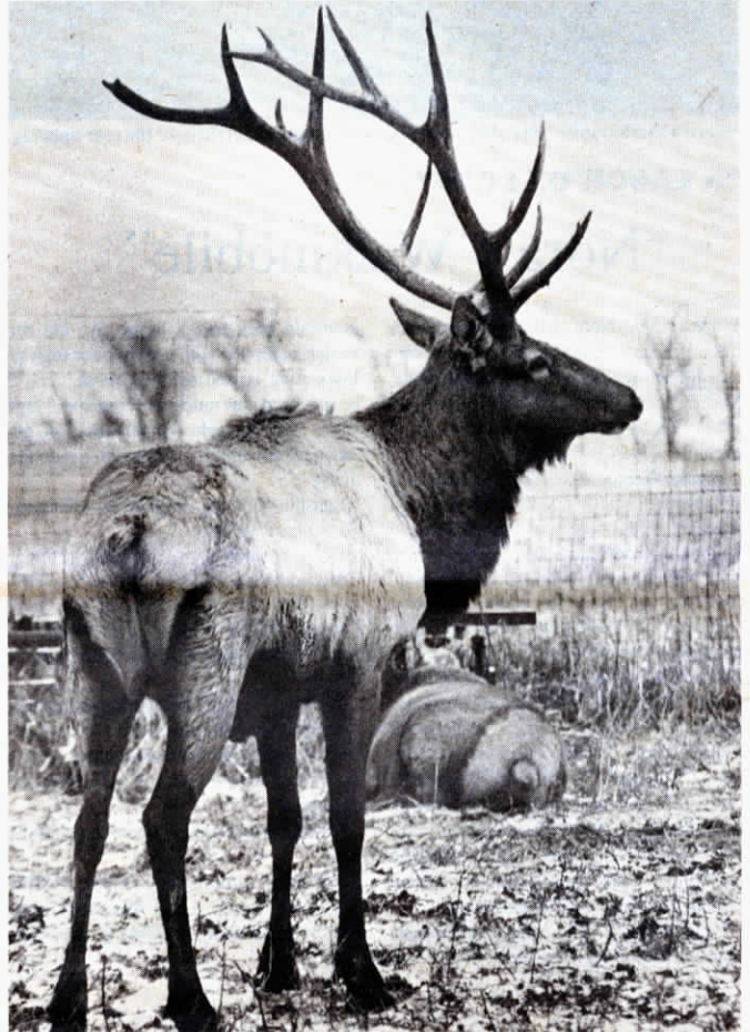
An average trophy-size bull elk's rack has a beam of at least 45 in. and 6 points on either side.