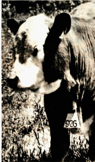
Long-lasting Boc-Loc tags attach to hole punched through loose dewlap skin.

For more information, contact: FARM SHOW Followup, Bock's Cattle-Identi Company, 3101 Cedar Ave., P.O. Box 614, Mattoon, Ill. 61938 (ph 217 234-6634).