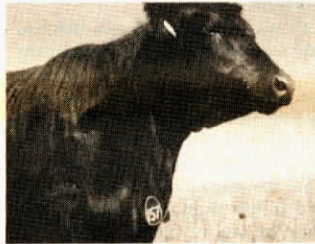
Life-O-Ear tags also fasten to brisket.

For more information, contact: FARM SHOW Followup, Forrest Nelson Ranch, Lakeside, Neb. 69351 (ph 308 327-2757).