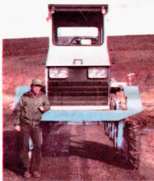
Spray Goat's frame height raises to 40 in. for row crop application.

Hill says that at $90,000 the Spray Goat is targeted to custom applicators. The company also makes a smaller version, called the Spray Kid, that's equipped with a 60-ft.