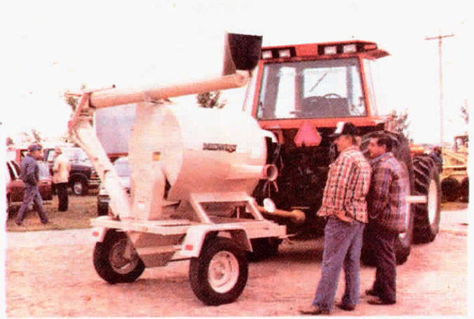
Grain is "inhaled" through flexible tubing by a fan, then moved by a 7-in. dia. auger which acts as an air lock.