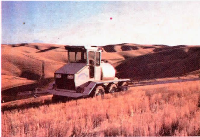
Spray Goat's heavy-duty suspension allows it to move 10 to 15 mph over even the worst terrain.