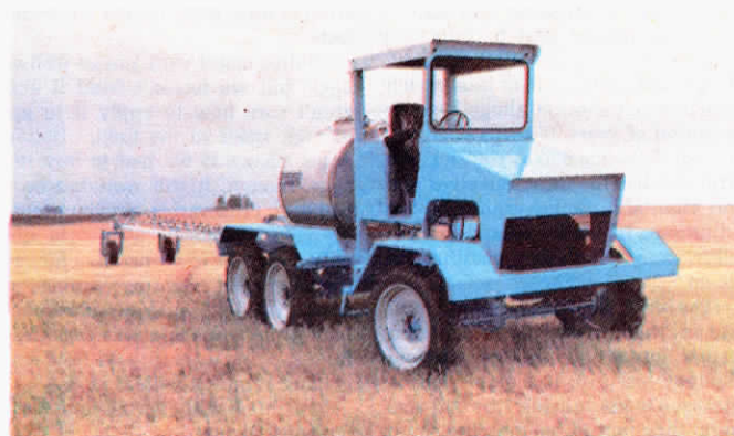
Smaller Spray Kid is similar to Spray Goat except it isn't self-leveling on slopes.

For more information, contact: FARM SHOW Followup, Hillco, 107 First Ave., P.O. Box 277, Nezperce, Idaho 83543 (ph 208 937-2461).