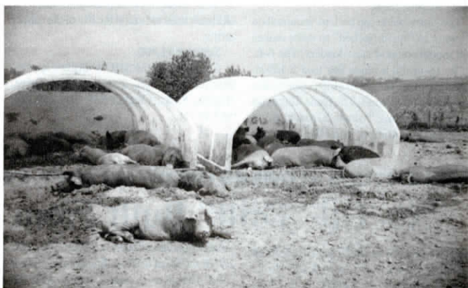
Three sections can be bolted together to make a 12 by 18-ft. shelter.

Contact: FARM SHOW Followup, J. Houle & Fils Inc., 4591 Rte. 143, CP:370, Drummondville, Quebec, Canada J2B 6W3 (ph 819 477-7444).