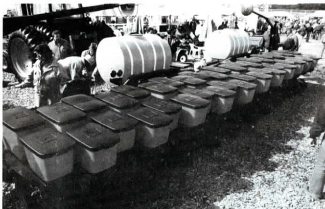
Friesen recently exhibited this 30-ft. toolbar equipped with 23 15-in. rows. Note staggered row units.