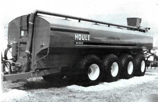
In order to turn without digging up fields, 6 of 8 wheels steer hydraulically.