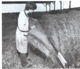
Loader-mounted bale saw cuts through bales in 25 to 30 sec.

The engineers used an industrial sicklebar designed to cut paper to build the bale saw. They replaced the cutterbar on the unit with their own 7-ft. 3 in. long, 4-in. wide, 3/4-in. thick sicklebar. The cutting edge is a 1 in. wide bandsaw blade with 3 teeth per