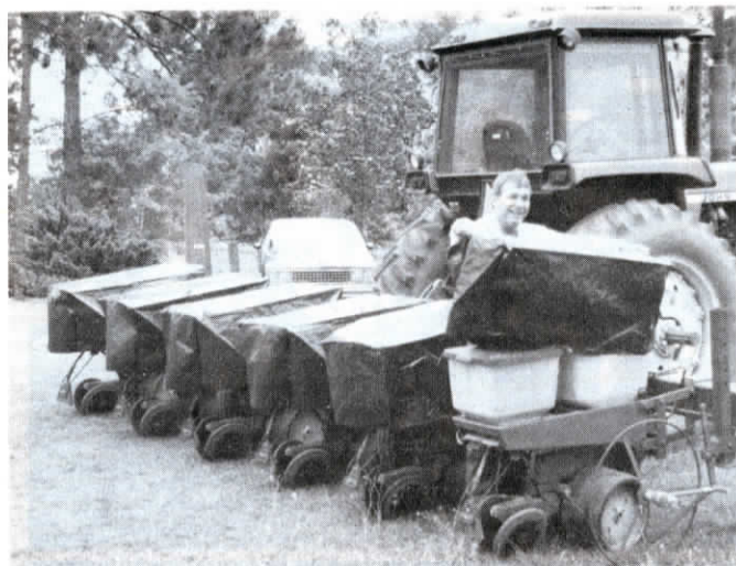
Planters stored inside can also benefit from being covered, says the manufacturer.