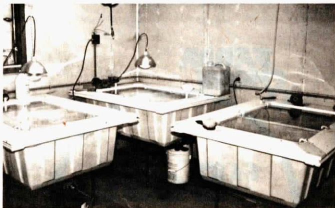
The 30 by 48-in. "tubs" can be placed anywhere. A built-in flush pan makes for easy disposal of manure.