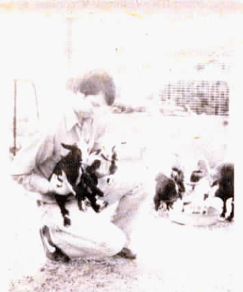
Pygmy goats evolved in Africa. At maturity they stand less than 2 ft. tall at the withers.