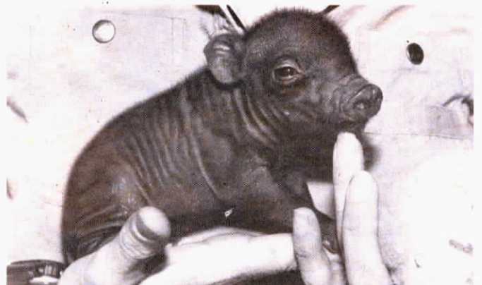
Miniature potbellied pigs are a hot commodity, selling for as much as $13,000 apiece at recent exotic animal auctions.