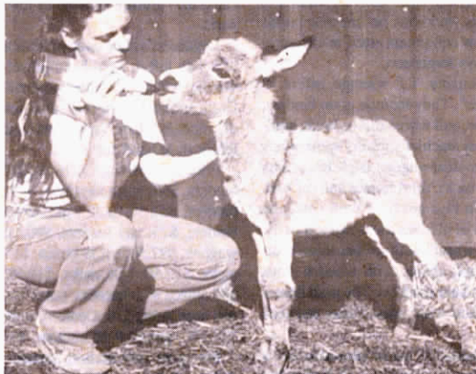
There's a big demand for miniature donkeys to act as "guard dogs" for sheep because of their inbred dislike of dogs and coyotes.