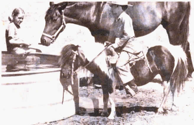
Registered miniature horses are no taller than 34 in. from ground to bottom of mane.