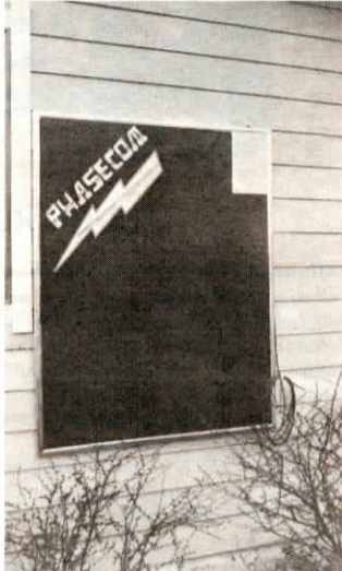
Flat plate antenna looks like a solar panel.

For more information, contact: FARM SHOW Followup, Future Communications, Inc., 3624 Citadel Dr. No. Suite 239, Colorado Springs, Colo. 80909 (ph 303 591-9683).