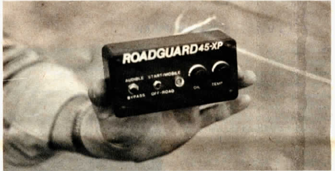
"Roadguard" shuts down engine when either oil pressure or engine temperature get out of control.

engine when preset danger levels are reached, the Roadguard can also be fitted with loud alarm systems.