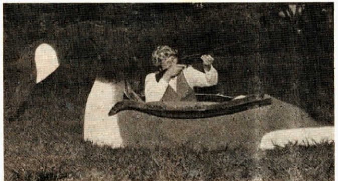
As geese approach, hunter flips open double doors on back of "Trojan Goose" and shoots.

The Trojan Goose weighs 37 lbs., including the chair. It's fitted with