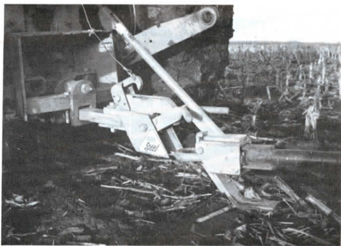
Two-part hitch mounts on tractor's drawbar and implement tongue. "Catch loop" stand holds tongue 8 in. off the ground.