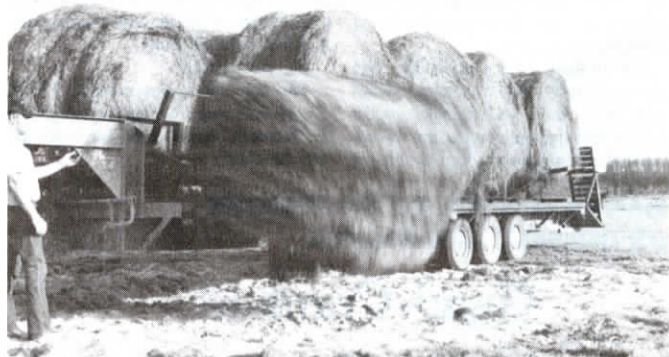
Photo shows 34-ft. trailer with units mounted on 6 1/2-ft. centers, allowing 10 bales to be carried at a time.

For more information, contact: FARM SHOW Followup, Eugene Clooten, Dakota Oil Mill, P.O. Box 6175, Bismarck, N.Dak. 58506 (ph 701 258-9493).