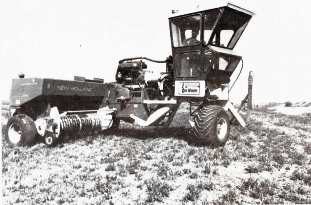
Adapter plate allows "One Wheeler" self-propelling system to be transferred from baler to swather or other pull type equipment.

For more details, contact: FARM SHOW Followup, Keith Manufacturing, Box 1, Madras, Oregon 97741 (ph. 503-475-3802).