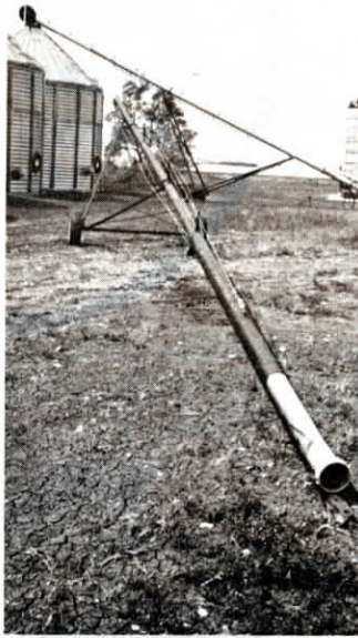
Flexible tubing from the grain vacuum system connects up to a length of flexible tubing at the bottom of the "augerless" auger tube that carries grain up into bins.

made up of 5, 10 and 20-ft. sections, connected with cam lock fittings which make it easy for one man to move and connect the grain handling system. Manness says that when his yard is wet at grain-hauling time, he can use the "blauger" to blow grain out of a bin to an area where the gravel is good enough that he can load trucks.