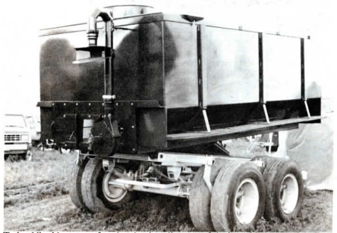
To haul liquid manure, four hatches install on top of the box. Manure can then be spread either with a 10-ft. gravity bar or a hydraulic-powered spreader.

For more information, contact: FARM SHOW Followup, Implement Dealers Supply, Mountain Lake, Minn. 56159 (ph 507 427-3048).