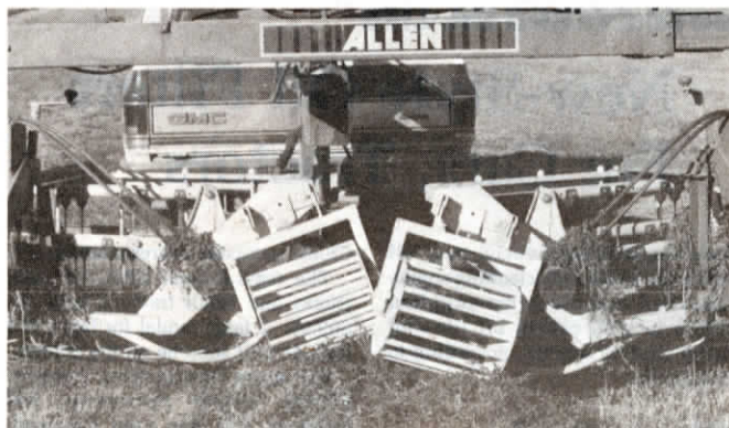
Free-wheeling windrow-shapers mount on ends of basket rakes.

For more information, contact: FARM SHOW Followup, Swihart Sales Co., Rt. 3, Box 73, Quinter, Kan. 67752 (ph 913 754-3513).