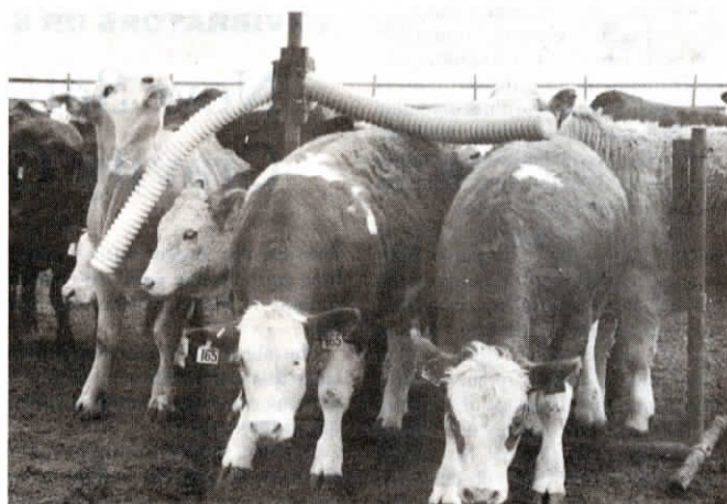
Each disposable tube treats 40 to 60 animals for 2 to 3 weeks.

For more information, contact: FARM SHOW Followup, G & P Incorporated, Rt. 4, Box 4960, Jerome, Idaho 83338 (ph 208 324-3773 or 208 324-5584).