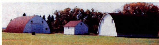
Photos show various type quonsets that can be built from salvaged arch-roof barns. They can be converted into a home, farm shop, machine shed, granary, or modern dairy barn.