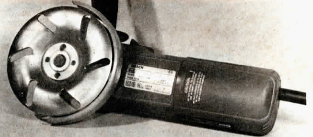
Evenly spaced "plug-free" cutting edges on disc slice off tiny slivers of hoof.

Contact: FARM SHOW Followup, Frank Schwiderson, Box 30, Dafter, Mich. 49724 (ph 906 248-5536).