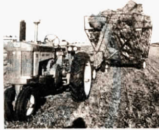
Bales push themselves single file up chute and into self-load and self-dump wagon.

For more information, contact: FARM SHOW Followup, M.K. Martin Enterprise Inc., Rt. 4, Elmira, Ont. N3B 2Z3 Canada (ph 519 664-2752 or 3621).